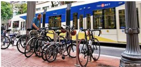
Figure 8. Bicycle Parking

Appropriate notification system: Bike lanes should have adequate access to telephone booths for demanding bicycle repair services, if necessary, dispatching an ambulance when it is called for (Kanafolakhari, 2010).