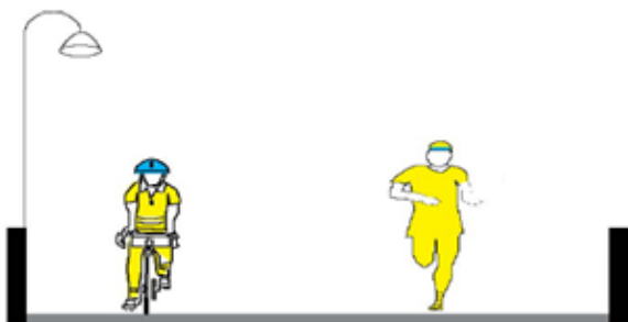
Figure 3. The shared path

Path must have "slick and smooth surface without any lumps or depressions in order to prevent injury to the rider or to make sudden changes in direction. (Fig. 5)