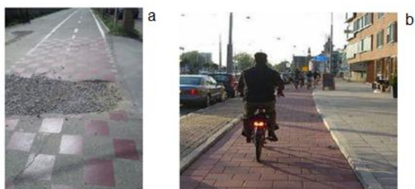
Figure 5. Difference between slick and smooth surface in any country a) Hamadan b) Optimal sample

Comfortable and easy path: Ease of way help the community groups who have limited physical abilities to use it (Shahabian, 2003). Unfortunately, the bikes used in the study lacked the necessary springs making the bicyclists upset. The path slope rate, short paths of high slope, straight and strong flooring, lighting and weather conditions are among the factors to deal effectively with that cause more comfort. The main focus of this section is that bikes can be used in conjunction with the convenient public transportation. Taking the bike on the bus, subway, tram and other public transport should be prioritized in traffic synchronization plan (James, 2006). This point was not observed in Hamadan and the path under the study (Fig. 6).