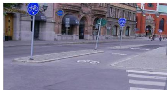
Figure 2. Special or semi-exclusive lanes

Specific paths: These pathways are generated independent of the other motor vehicle paths and simply for bicycle traffic. Their widths is usually between 2.4 to 3.6 m and are generally designed in recreational areas, parks and areas outside the city free from spatial limitations where there is possibility of traffic separation (Fig. 1).