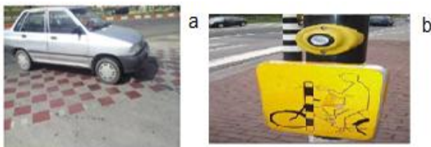
Figure 4. Interference of bike lanes and motor vehicles, a) Hamadan b) Use of new technologies