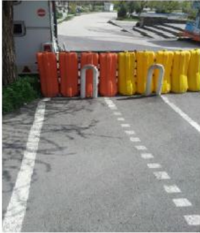
Figure 7. Discontinuity of a bicycle path in Hamedan