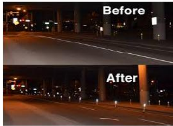
Figure 10. Good night lighting