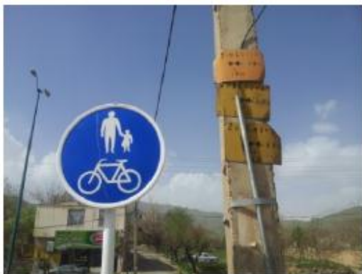
Figure 9. Neglecting aesthetic issues in placement of warning signs in Hamadan

Warning signs and boards: Warning signs and boards with the standards for color, size, position and angle of placement and aesthetic issues (Fig. 9) in all directions and warning signs at night (Fig. 10) are critical points that should be of great interest.