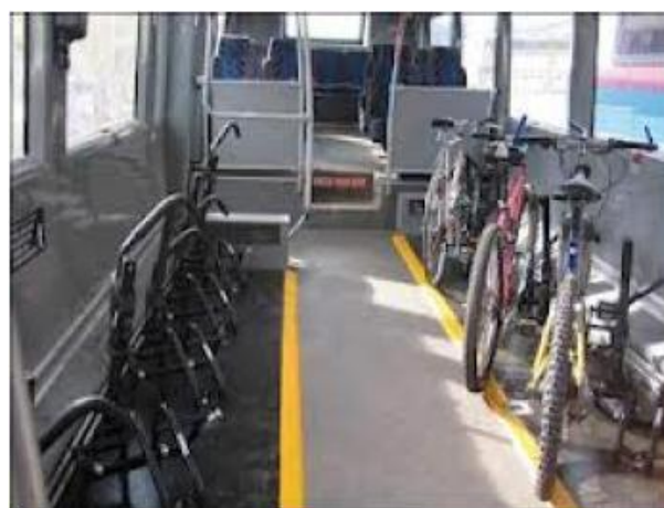
Figure 6. Carrying bicycles in public transport vehicles

The path continuity: Continuity of bicycle path in linking the different land uses within the city is very important which did not happen in the city of Hamadan (Fig. 7) and the comprehensive plan should consider it. In the design of the network, the whole city must be related by a dense network of bike trajectories to residential, business, shopping and leisure places (Garib, 2008; Kanafolakhari, 2010). The integrated bicycle network that connects the sources to all destinations and the facilities and equipment necessary for the vehicle change (for example bike parking stations in the bus terminals) is considered (Fig. 8) to be the main component of the development of cycling in cities (Development, 1996).