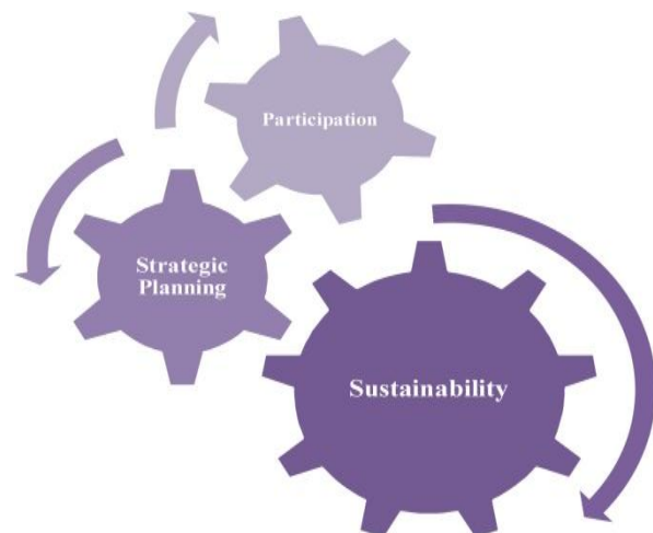
Figure 1. Main pillars of an urban revitalization planning (Roberts and Sykes, 2000)

Sustainability means that economic, social, and political atmosphere should ensure desired life quality and preserve topics like hygiene, education, welfare, freedom of expression, rights, etc. in a stable and persistent manner, so that future generations could make use of those resources. These concepts have special properties like social stability, social justice, novel moral framework, public convergence, and evaluation (Eshtiaghi, 2008). In terms of sustainable development, land and space are not merely elements to fulfil urban economical and physical needs. Rather, they are the major background for all citizens' activities and a necessary tool for human wants and wishes to get realized. From this perspective, urban land and space are probably the main public wealth, with a deeper and broader role than an economical good in public urban life and citizens' lives (ibid).