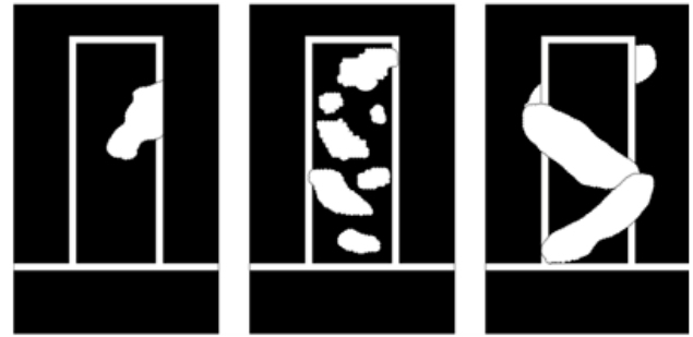
Figure 3. Three different using forms of plants

The main features of ecological design is utilizes both the outside and around it by using plants.