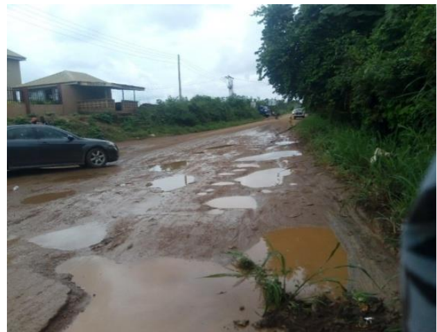
Figure 1. Typical Failed Sections of Oshogbo Iwo Road.

the road pavement is underlain by schist with pegmatite intrusion, whose minerals have weathered into expansive clay.